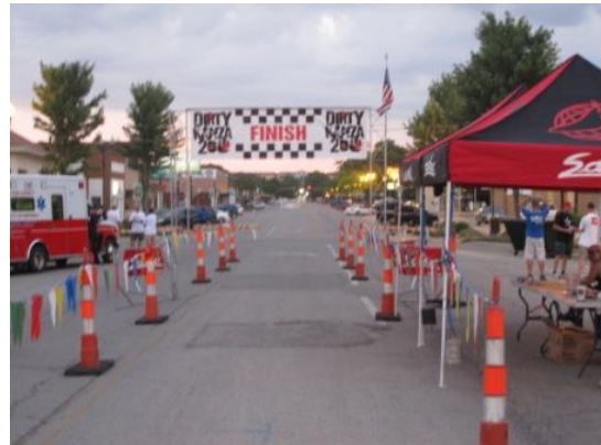
The Finish Line.

By midnight, the street was cleared, the beer garden was broken