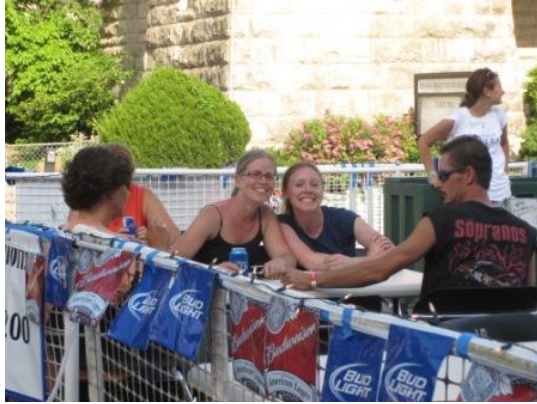
The Granada Theatre did a great job with the beer garden!